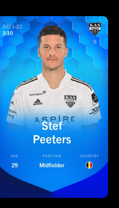
MV = 0.75 \Xi