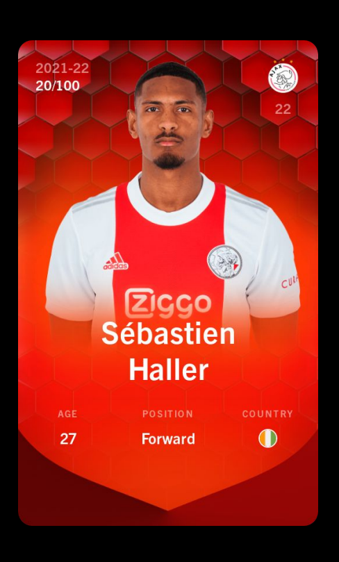
MV = 0.75 \Xi