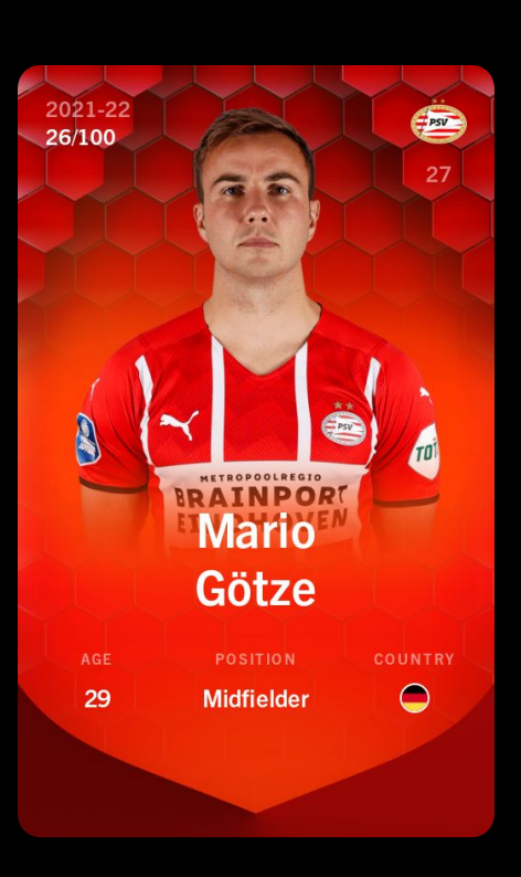
MV = 0.475 \Xi